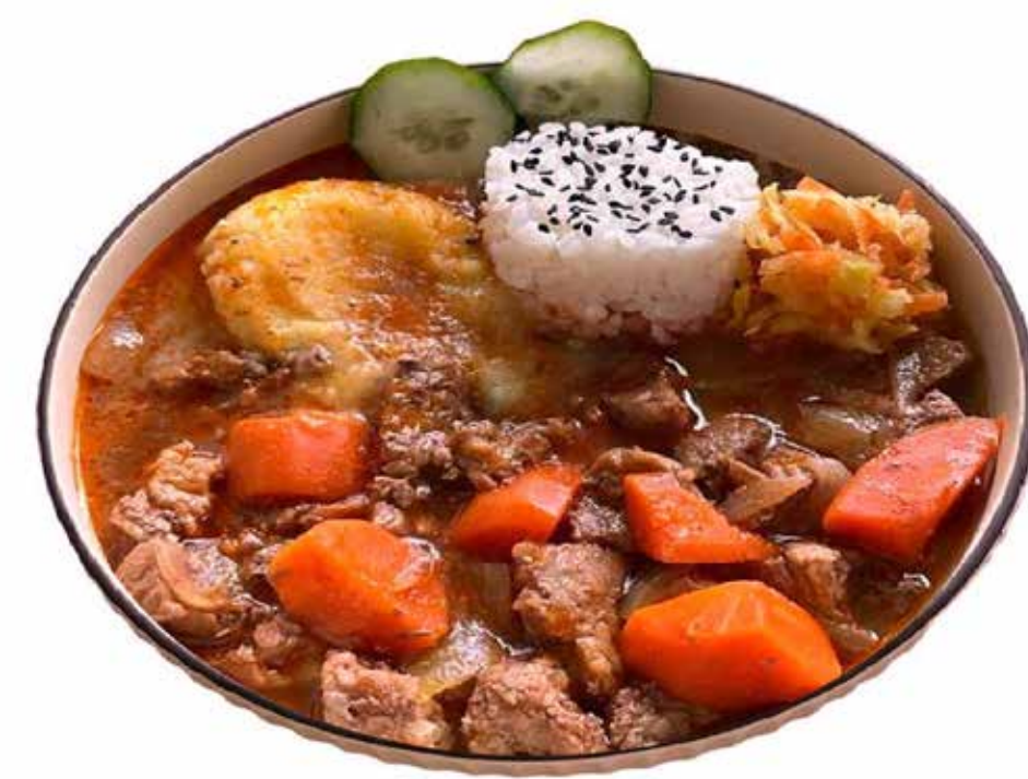
Hungarian Gulyash | Гуляш

Meat stew with mashed potato and veggies