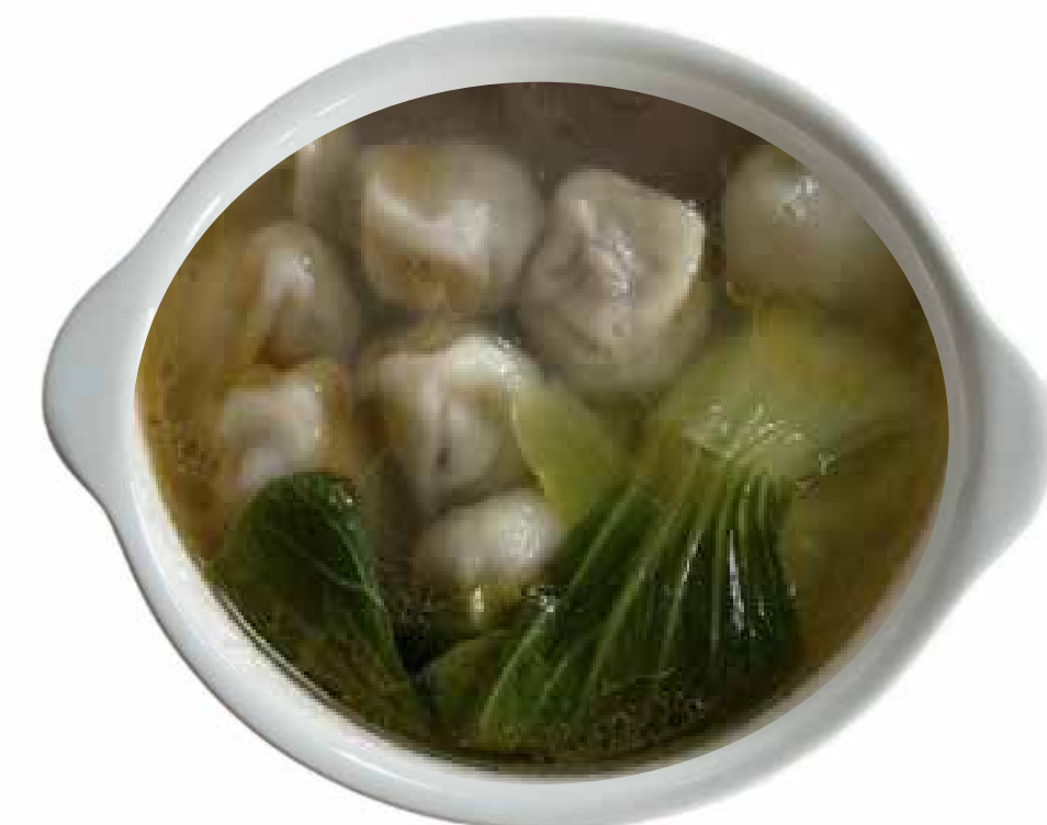
Mongolian Beef Dumpling Soup