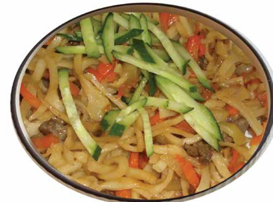
Mongolian -Stir Fry Noodle | Цуйван

Handmade noodle with meat and vegetables