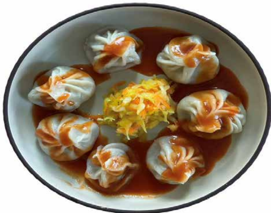
Mongolian Dumplings | Бууз