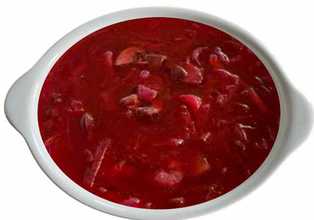
Eastern Borscht Beetroot Soup | Борщ