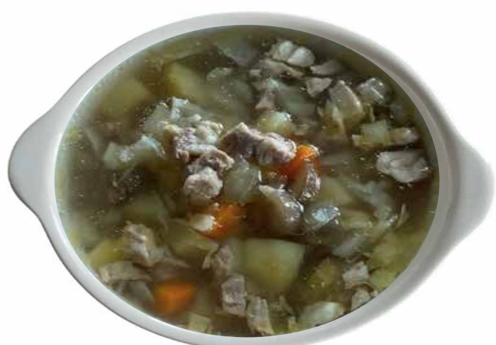
Mutton Vegetable Soup