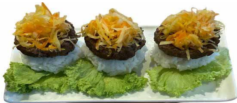
Beef kotlets with rice and salad