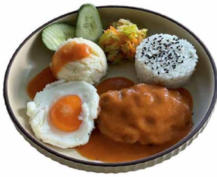
Russian Kotlet | Бифштекс