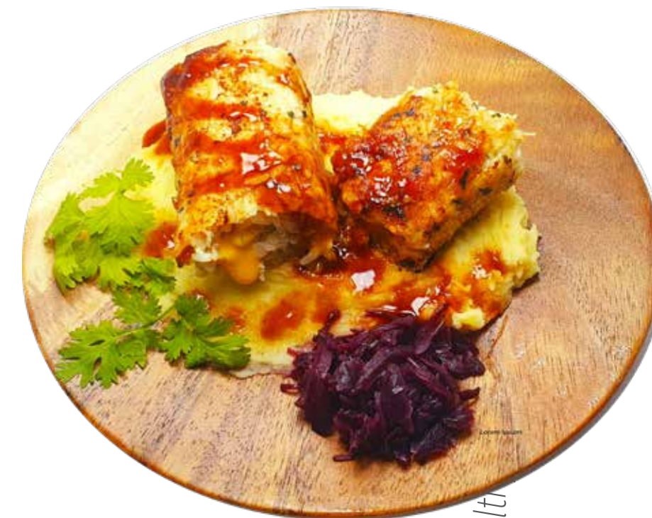
Eastern Chicken Tefteli | Тефтели