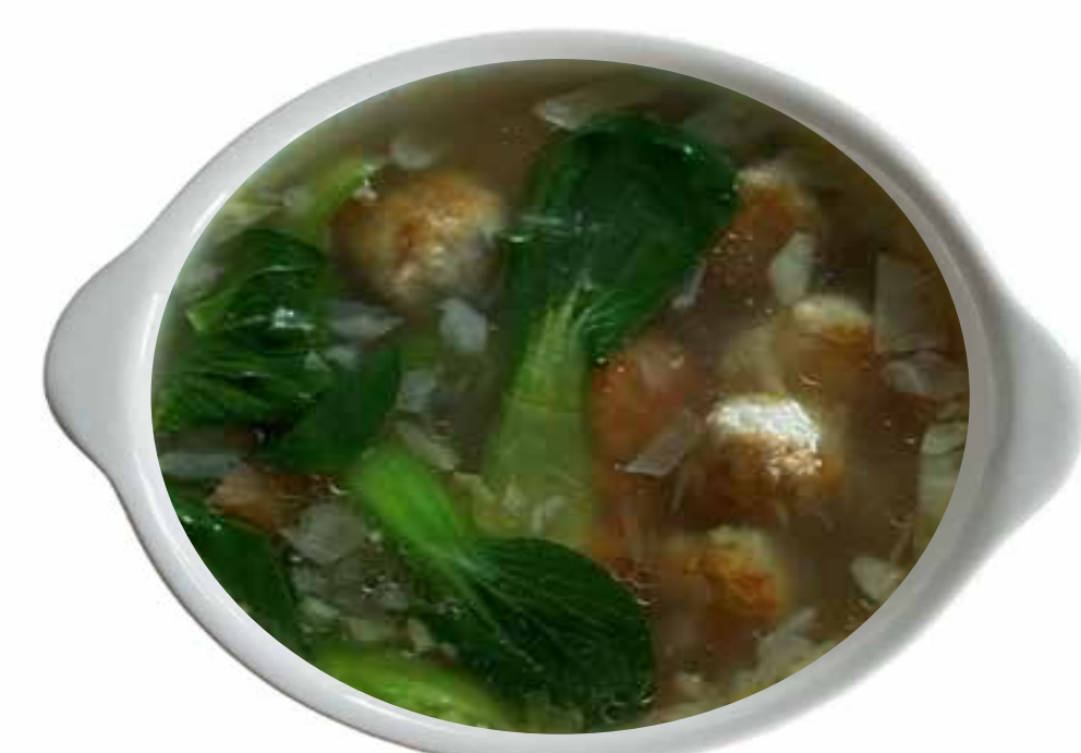
Chicken Meatball Soup