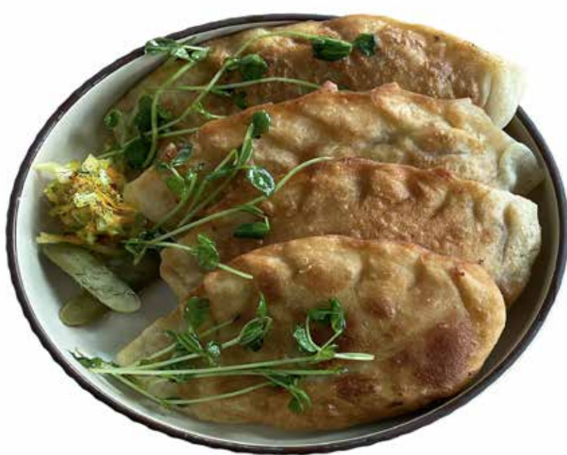
Mongolian Meat Pastry | Хуушуур